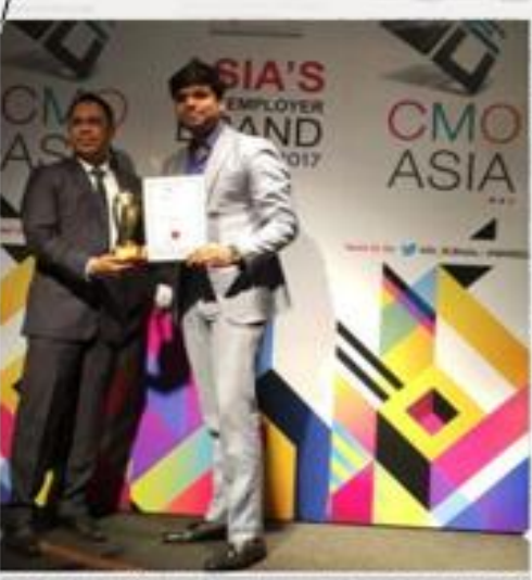
The Only Vita Service Provider recognized on Asia BEST CSN PRACTICES Awards 2017

NEW DELHI : BLS International, the world's largest Indian specialist service provider for outsourcing of visa, passport, attestation and consular services to the governments and diplomatic missions globally since 2005, won the Best Workplace Practices Award at the recent Asia Best CSR Practices Awards 2017